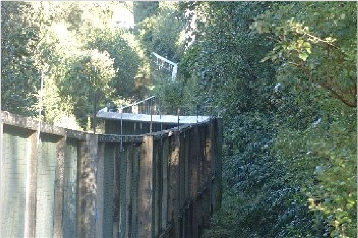
Figure 3: Predator proof fence along the western boundary of MPCR.