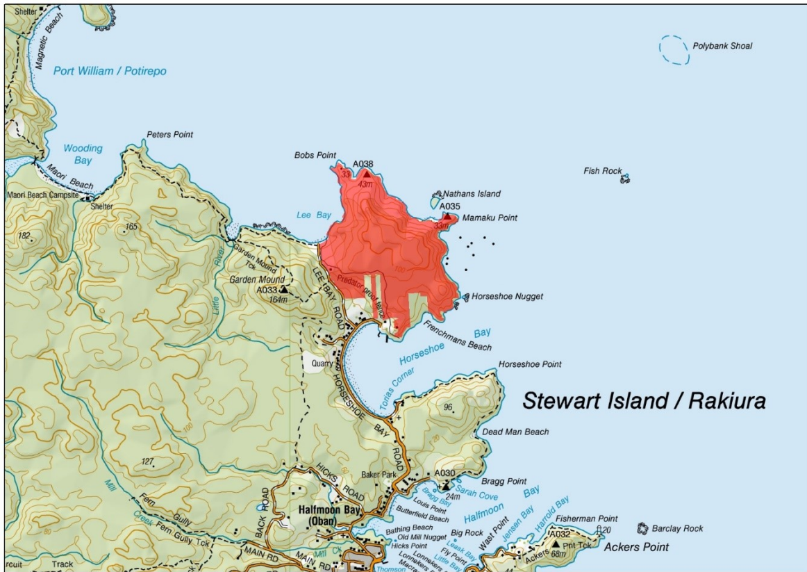
Figure 1: Topographical map showing the location of MPCR (shown in red).