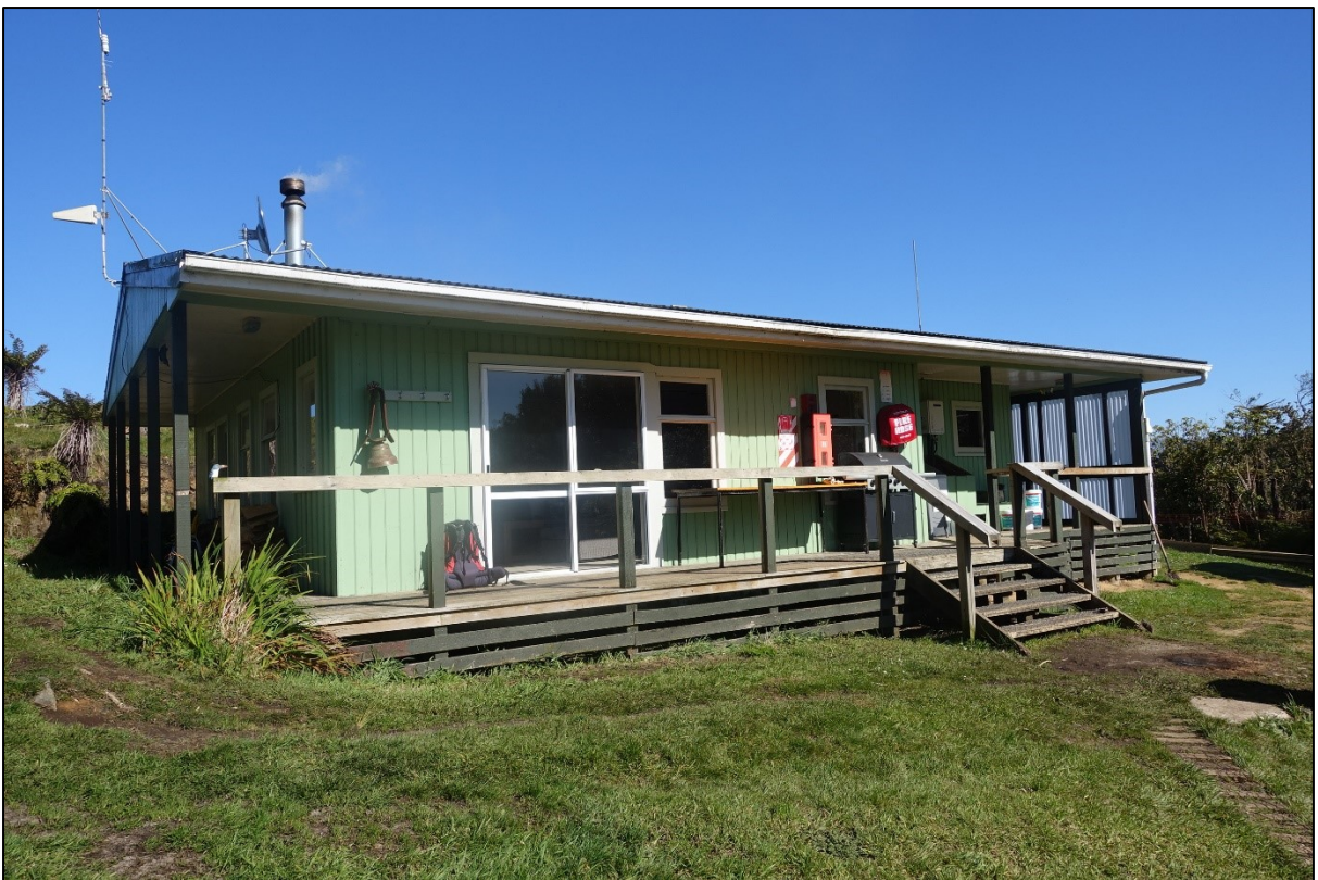
Figure 4: Environmental education centre facilities at MPCR.