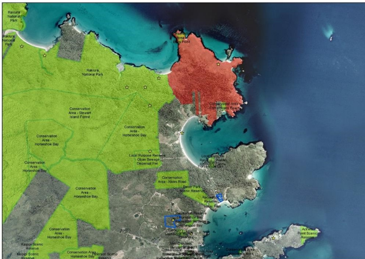
Figure 2: Aerial photograph showing the location and protection status/land tenure of habitats near MPCR (shown in red). DOC land is shown in green. QEII covenants are outlined in blue. Stars = known archaeological sites.